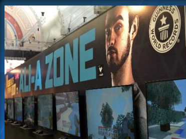
AND MUCH MORE...