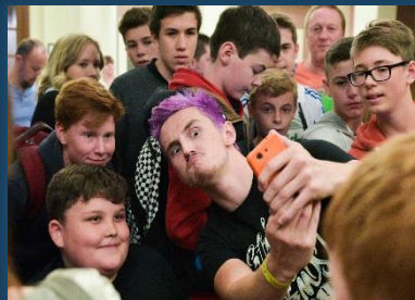
MEET & GREETs