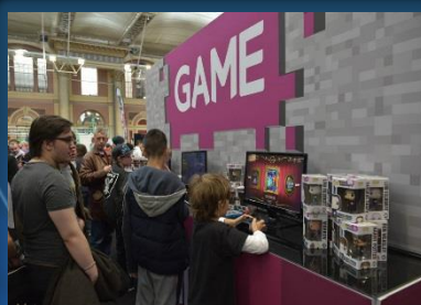
2000m2 OF EXPO SPACE